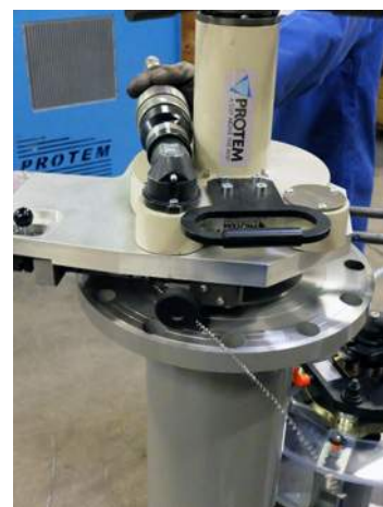
US80-2400 Flange Facing Attachment